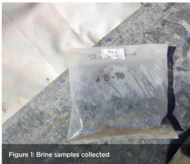
Figure 1: Brine samples collected

Pumping tests were carried out on wells P-1, P-2 and P-4 between 2015 and 2017. A further pumping well will be installed in October 2021 to provide additional information on brine flows in the Old Code tenements to optimise well design and pump sizing for production from this area.