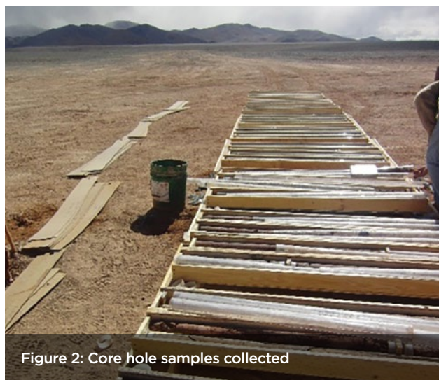
Figure 2: Core hole samples collected