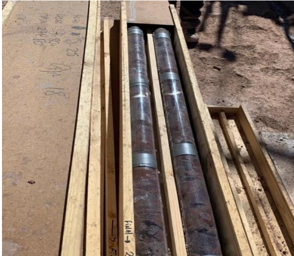
Figure 3 – Core samples recovered from the first completed hole