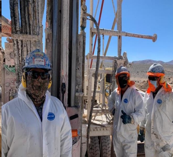
Figure 4 – Shift one Drilling crew on site